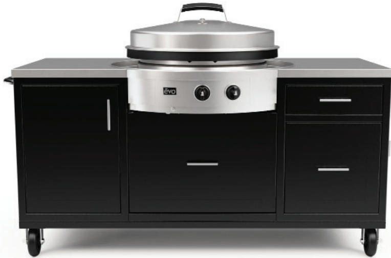
Evo Cooktop sold separately.